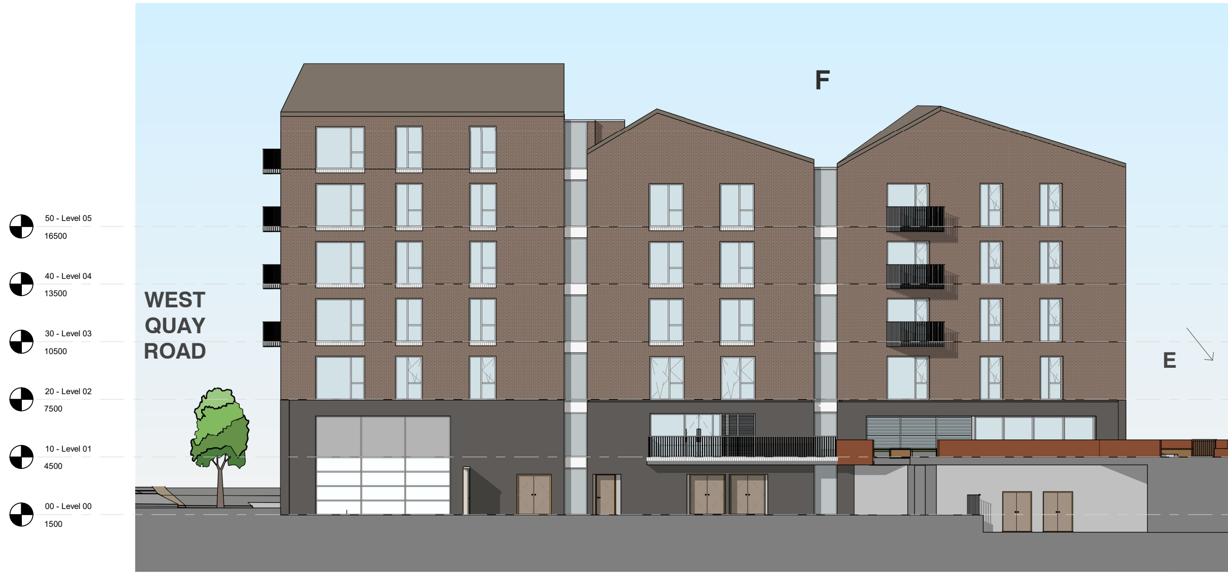
Block F East Elevation 1 : 200