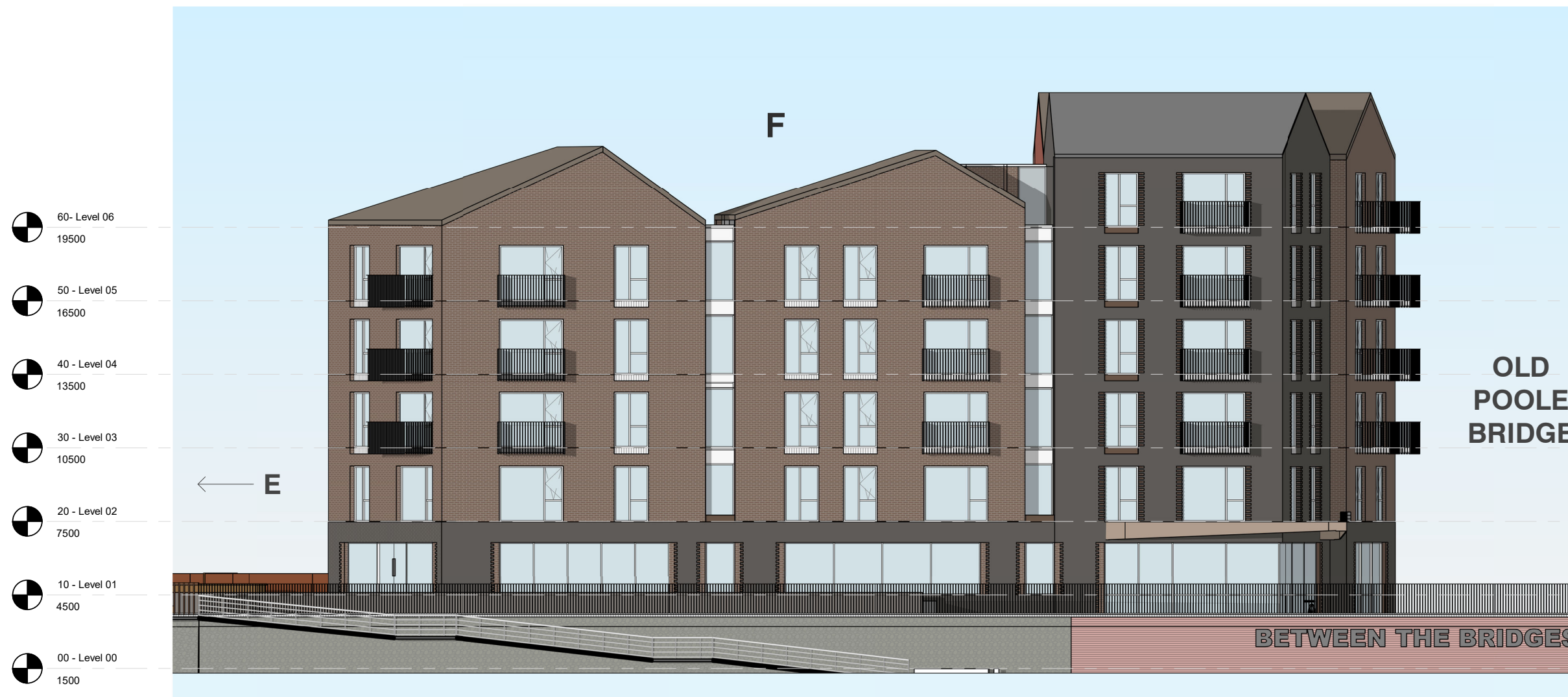
Block F West Elevation 1 : 200