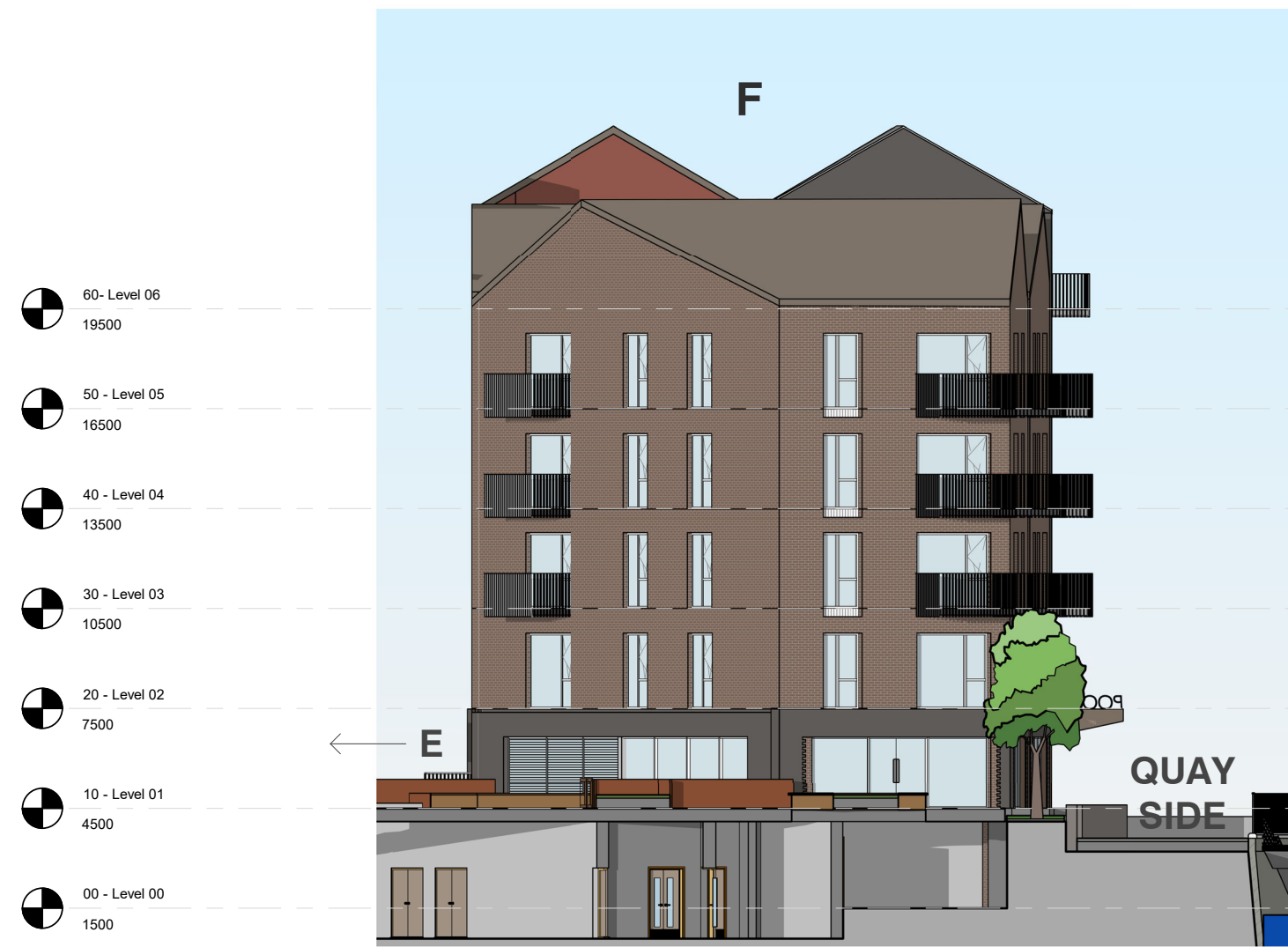
Block F North Elevation 1 : 200