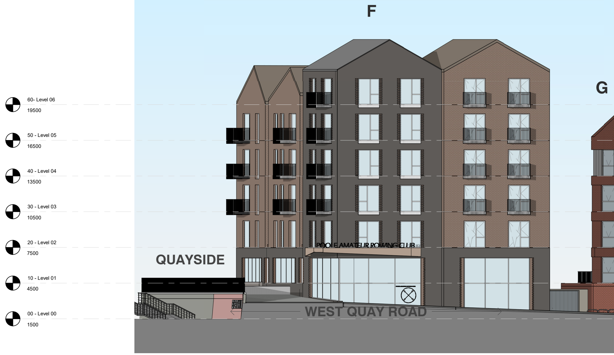
Block F South Elevation 1 : 200